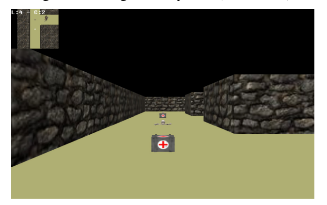
Figure 2 – Labyrinth with some rewards.